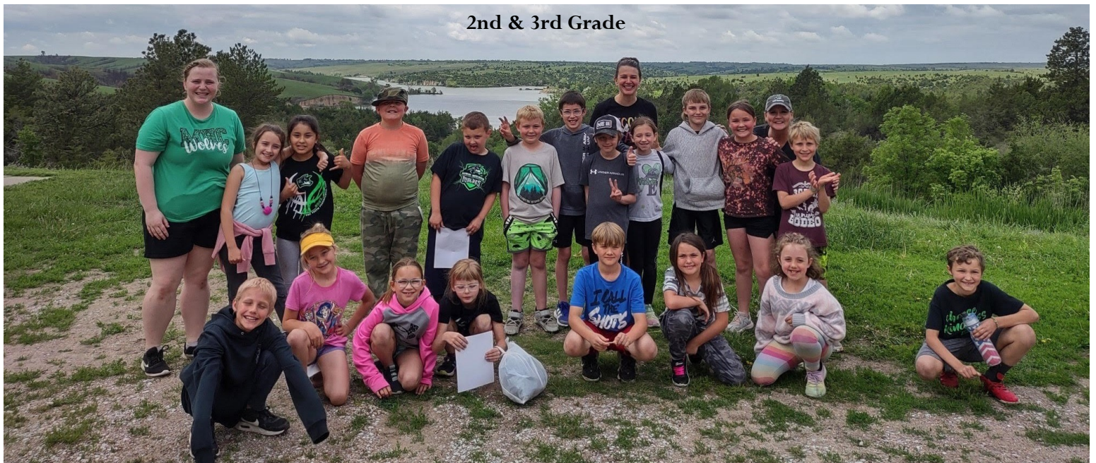
2nd & 3rd Grade