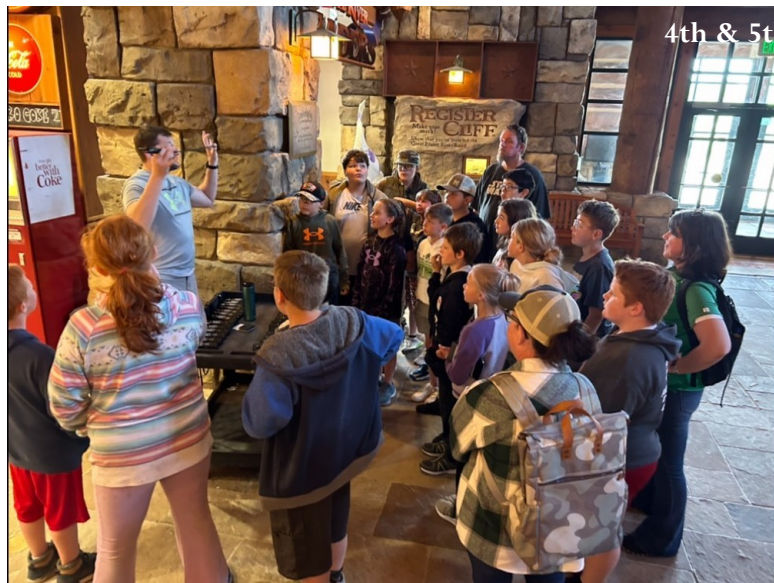
4th & 5th Grade