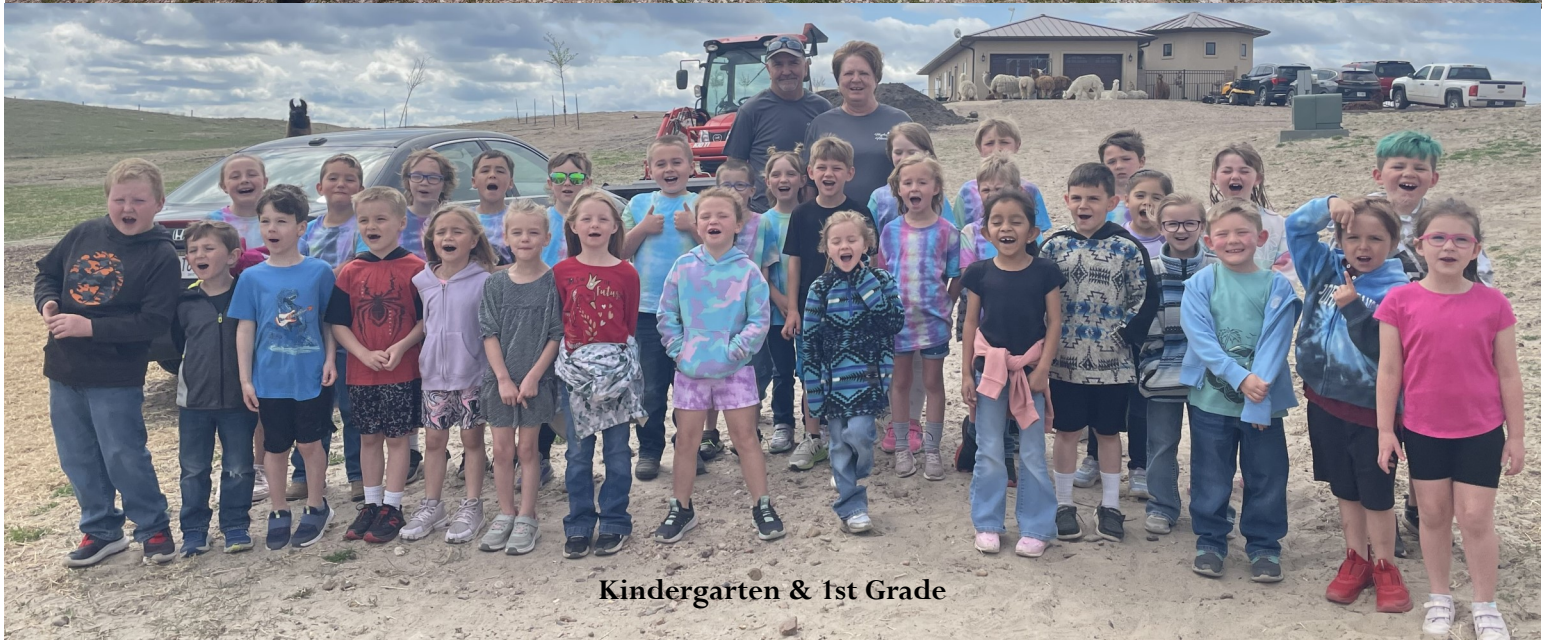
Kindergarten & 1st Grade